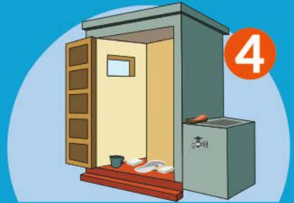
After using toilet