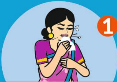
After coughing and sneezing

Remember to wash hands with soap frequently