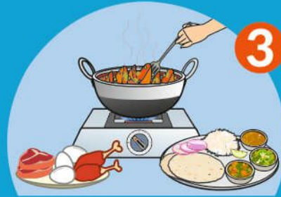
Before cooking, after cooking and before eating food