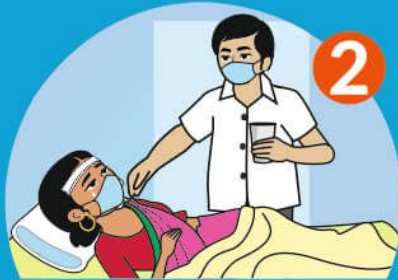
Clean your hands before and after caring for sick person