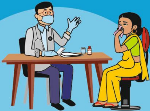
If you have cough, fever or difficulty in breathing, contact a doctor immediately

Stay protected! Stay safe from Coronavirus!